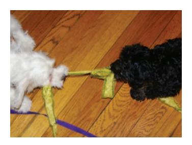
The hardwood flooring provides a dog friendly surface for Andie and Cooper's game of tug-of-war.

★ It's no longer necessary to have a large tartan plaid dog bed in the middle of your mid-fifties modern living room. If you are spending time, energy and hard-earned money to create the living room of your dreams, it's worth the additional investment to have pet beds and accessories custom-upholstered to match the style and design.