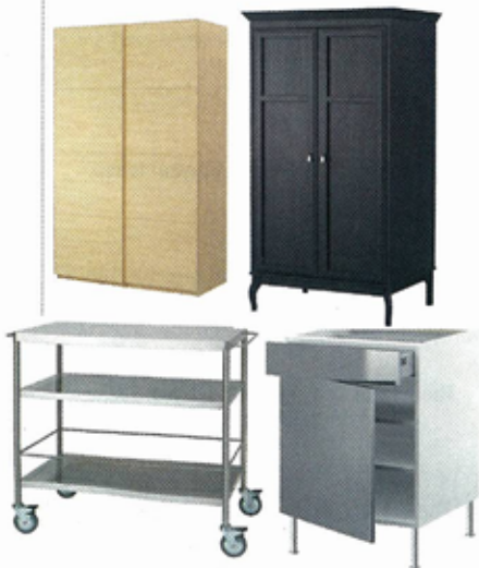
These wardrobe and stainless steel kitchen cabinets from IKEA make for great office storage units.

Lack of proper storage can often be an obstacle to functional ease and a professional image. Storing items in more interesting, non-office furniture pieces, like wardrobe cabinets or stainless steel kitchen cabinets, adds personality and instantly hides visual clutter.